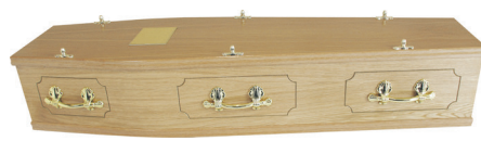
Rochester – Oak Veneer £520