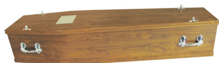
York – Oak Effect Foil Veneer £445