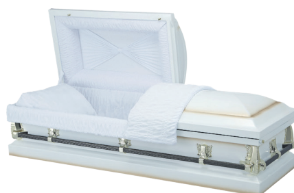
American-Style Caskets* American-style Caskets are available in wood or metal in a wide selection of designs From £1,470